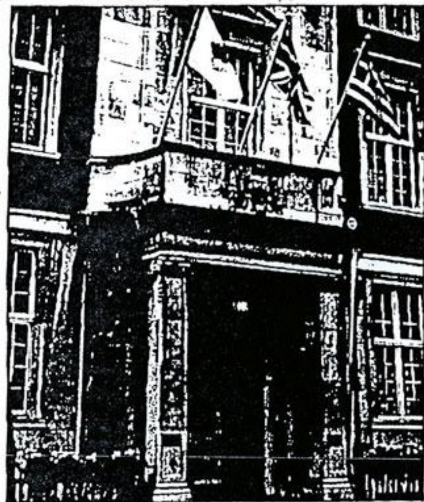
London's Hellenic Center (above) with the poster for the Vorres Museum's exhibition and the Cypriot, British and Greek flags. Left: A lively crowd at the opening of the show.