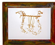
A Heart's Lyric