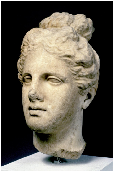
Head of Goddess Aphrodite, late 5th century BC - Cyprus Archaeological Museum, Nicosia

Cyprus Presidency of the Council of the European Union July-December 2012