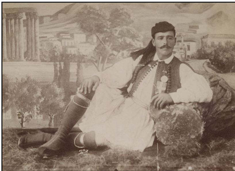
The winner of the first Modern Olympic Marathon Spyros Louis wearing his medal on the waist-coat of his fustanella, 1896